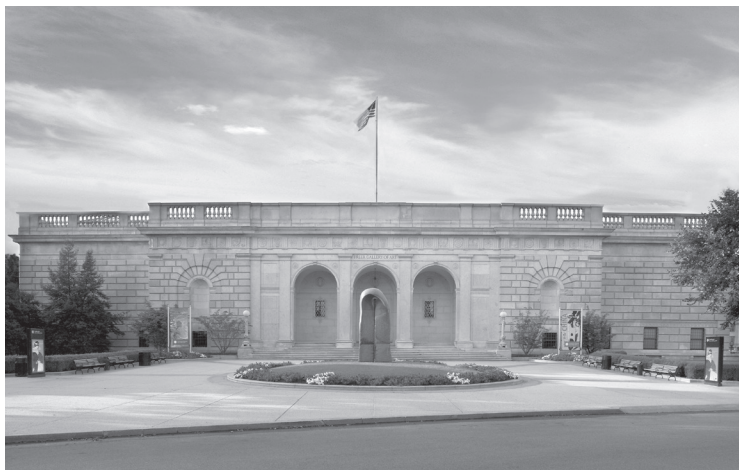
Freer Gallery of Art