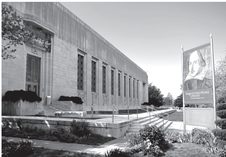
Folger Shakespeare Library